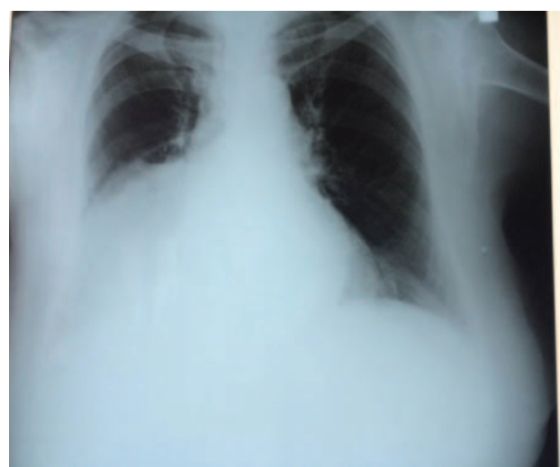
Fig. 1 – A posteroanterior chest radiograph shows an abnormal soft tissue opacity obscuring the right cardiac margin.